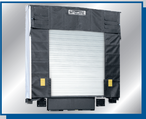
Seals and Shelters